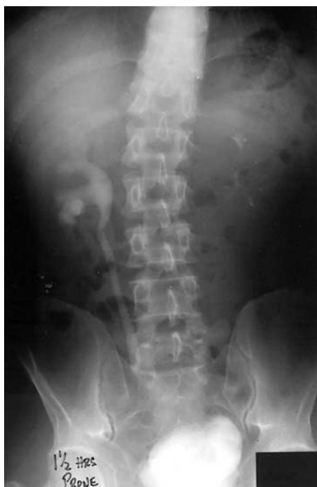
Figure 1 Intravenous urogram showing a dilated right renal pelvis and a dilated ureter. Note the scoliosis of the spine and compression of the right half of the urinary bladder by the abscess.

whereas 17% and 61% are primary in Europe and North America respectively. 8 Iliopsoas abscess is common in the young compared with the elderly. 9 It is reported to be commoner in males than females. 10-11 Bresee et al in a study of 142 paediatric patients with iliopsoas abscess found a 57% occurrence on the right side, 40% on the left side, and 3% had bilateral abscesses. 12 The mortality rate in primary iliopsoas abscess is 2.4% and in secondary abscesses is 19%. 13 Ricci et al suggested that the mortality rate in untreated patients is 100%. 8