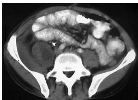
Figure 2 Computed tomogram of the abdomen and pelvis revealing a right psoas abscess.

Staphylococcus aureus is the causative organism in over 88% of patients with primary iliopsoas abscess. 8 Secondary iliopsoas abscess is caused by streptococcus species 4.9% and E coli 2.8%. 8 Mycobacterium tuberculosis as a cause of iliopsoas abscess is currently uncommon in the western world, but common in the developing countries. The other causative organisms include proteus, 9 Pasteurella multocida , 14 bacteroides, 15 clostridium, 16 Yersinia enterocolitica , 17 klebsiella, 18